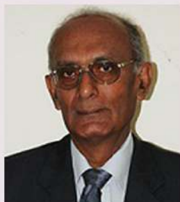
Mukund Reddy Oration

Title : “Recent Trends in Microsurgical Breast Reconstruction”